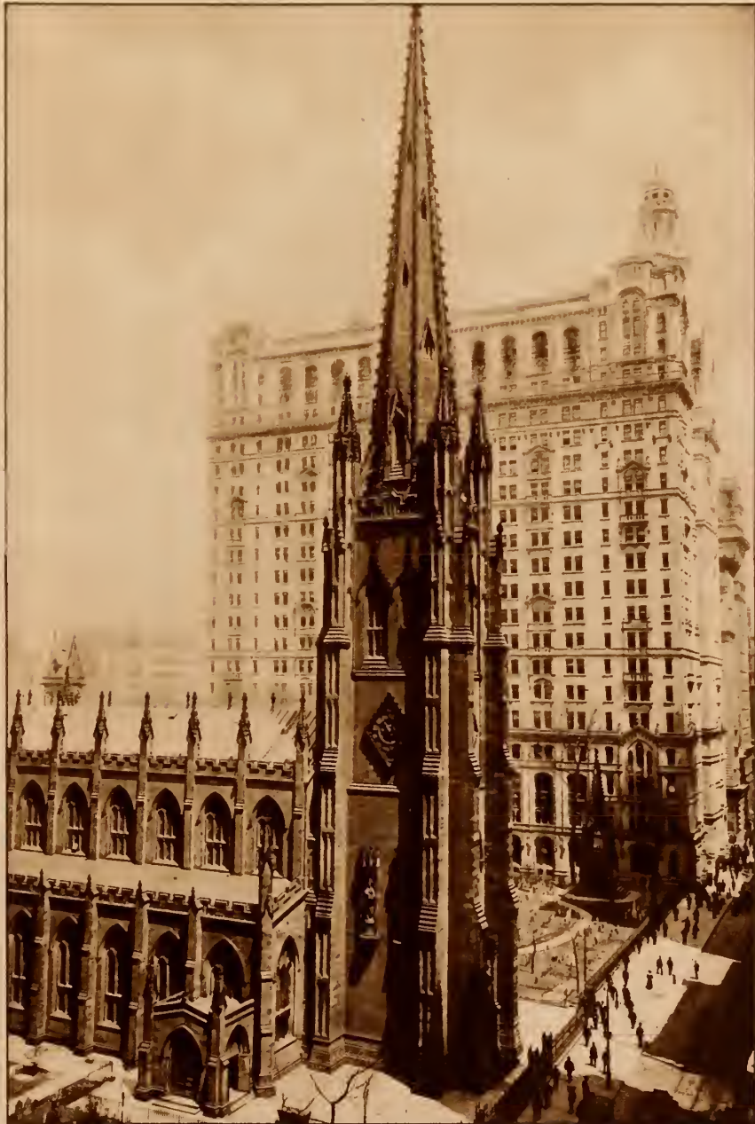
TRINITY CHURCH, occupying one of the most expensive sites in the city. Founded in 1696. Robert Fulton, Alexander Hamilton and other Americans are buried here.